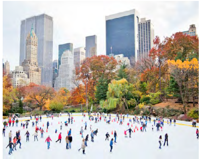
This NYC site is