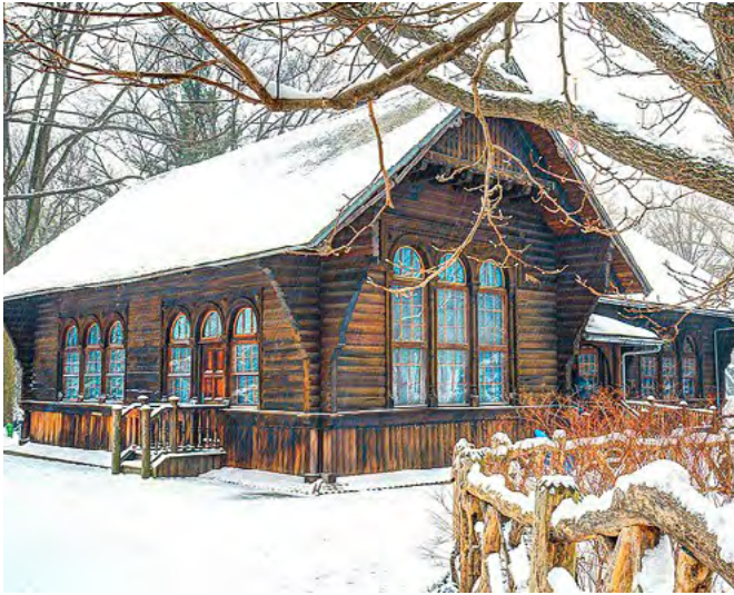
This NYC site is