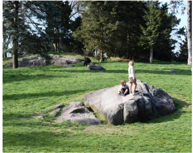
This NYC site is