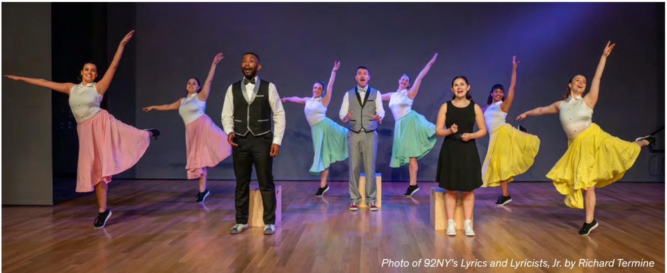
Photo of 92NY's Lyrics and Lyricists, Jr.