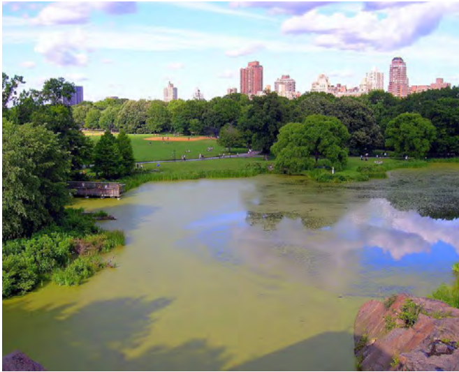
This NYC site is

For an added bonus: can you identify where in New York City they are all located? Use the word bank on page 7.