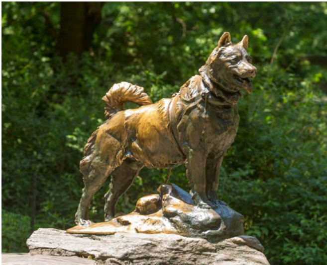
This NYC site is