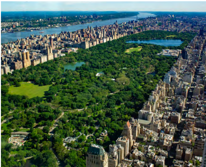
All the NYC sights are located in: