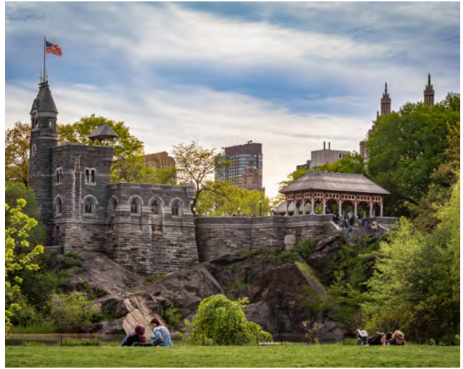
This NYC site is