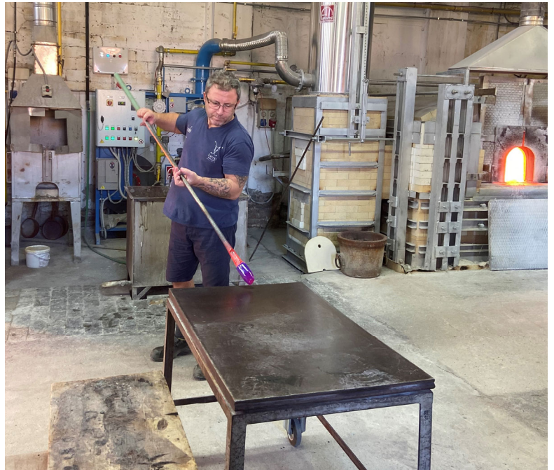
Master glassblower at work at Glasstress Studios

We are thrilled to collaborate with our friends at La RosaWorks to bring you this exclusive experience. Your tour includes six nights at a four-star hotel, daily breakfast, welcome and farewell dinners, private group airport transfers to our hotel pier, and unlimited use of the vaporetti service. After fulfilling days of touring with our group, you'll have plenty of leisure time to explore Venice's stunning architecture, tempting shops, and delicious restaurants. For art enthusiasts seeking more, we'll provide a curated list of recommended exhibitions, museums, and churches to visit.