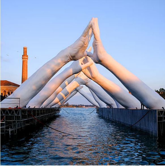
Lorenzo Quinn, "Building Bridges" 2019

Curated by Adriano Pedrosa, the Arsenale's main exhibition, "Foreigners Everywhere," celebrates artists enriched by global journeys, emphasizing diversity in race, gender, and nationality. It spotlights foreign, immigrant, diasporic, and refugee artists, bridging the Global South and North. In the Arsenale, both new and old works in "Nucleo Contemporaneo" and "Nucleo Storico" broaden the modernism narrative beyond Euroamerica, offering a fresh global perspective on diverse contemporary art voices.