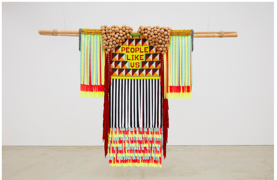
Jeffrey Gibson, "PEOPLE LIKE US," 2019

The 2024 Venice Biennale features an exciting array of international contemporary artists at the Giardini, including Jeffrey Gibson, the first solo Indigenous artist to represent the United States. His vibrant artworks seamlessly blend Western modernism with Native American craftsmanship. Other artists featured in the international pavilions include John Akomfrah for Great Britain, Julien Creuzet for France, and Archie Moore for Australia, all contributing to the celebration of diverse voices in contemporary art.