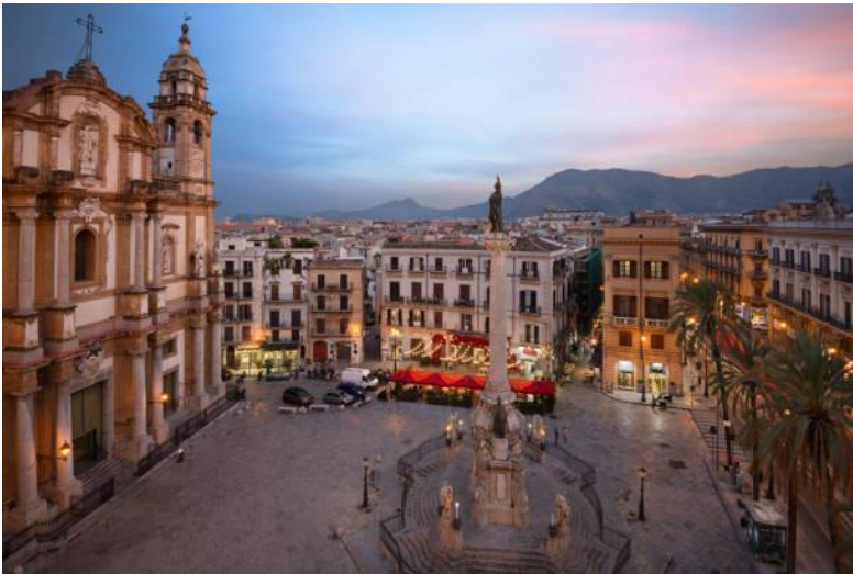
Palermo's Piazza San Domenico

"To have seen Italy without having seen Sicily, is not to have seen Italy at all, because Sicily is the clue to everything." – Goethe