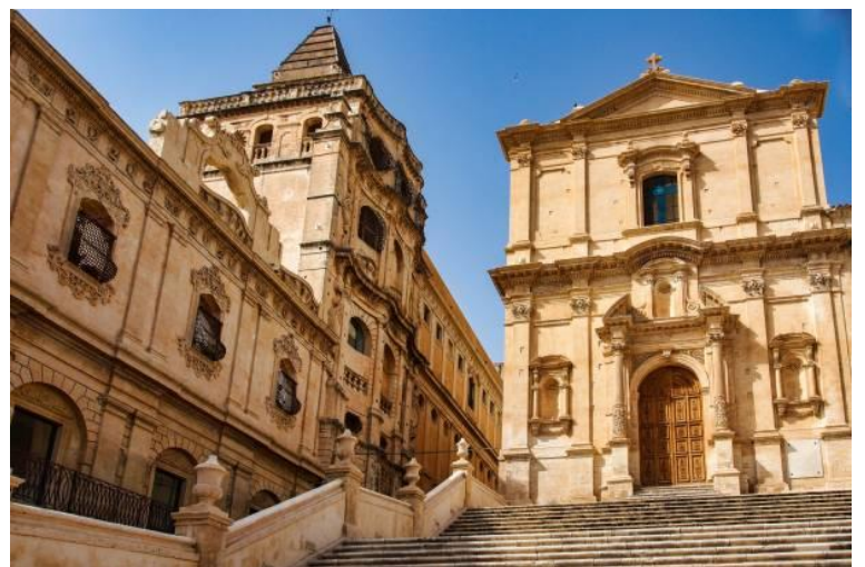
The town of Noto, famous for its Baroque architecture

Sicily's strategic location in western trade routes and rich agricultural lands placed it on the world stage for thousands of years. Its sometimes tumultuous, often mysterious, and always fascinating history has made it home to one of the broadest ranges of architectural styles to be found anywhere in the region: ancient temples and amphitheatres, Renaissance palaces, Baroque cathedrals, and a palimpsest of Norman-Arab-Byzantine influenced designs — all set within breathtaking natural views. Join Francis Morrone for curated walking tours that take a deep dive into some of Sicily's most well-known landmarks and picturesque towns and discover it for yourself.