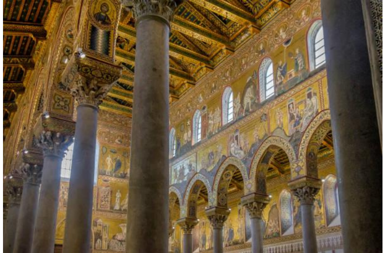
Glittering Byzantine mosaics in Monreale

From here, we'll venture into the countryside for a guided visit to Villa del Casale at Piazza Armerina, the supreme example of a luxury Roman villa with mosaics deemed by UNESCO exceptional not only for their artistic quality, but also their extent.