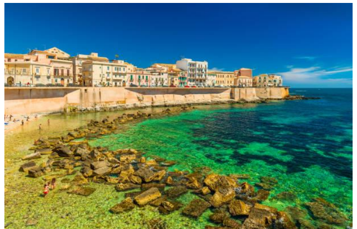
The island of Ortigia